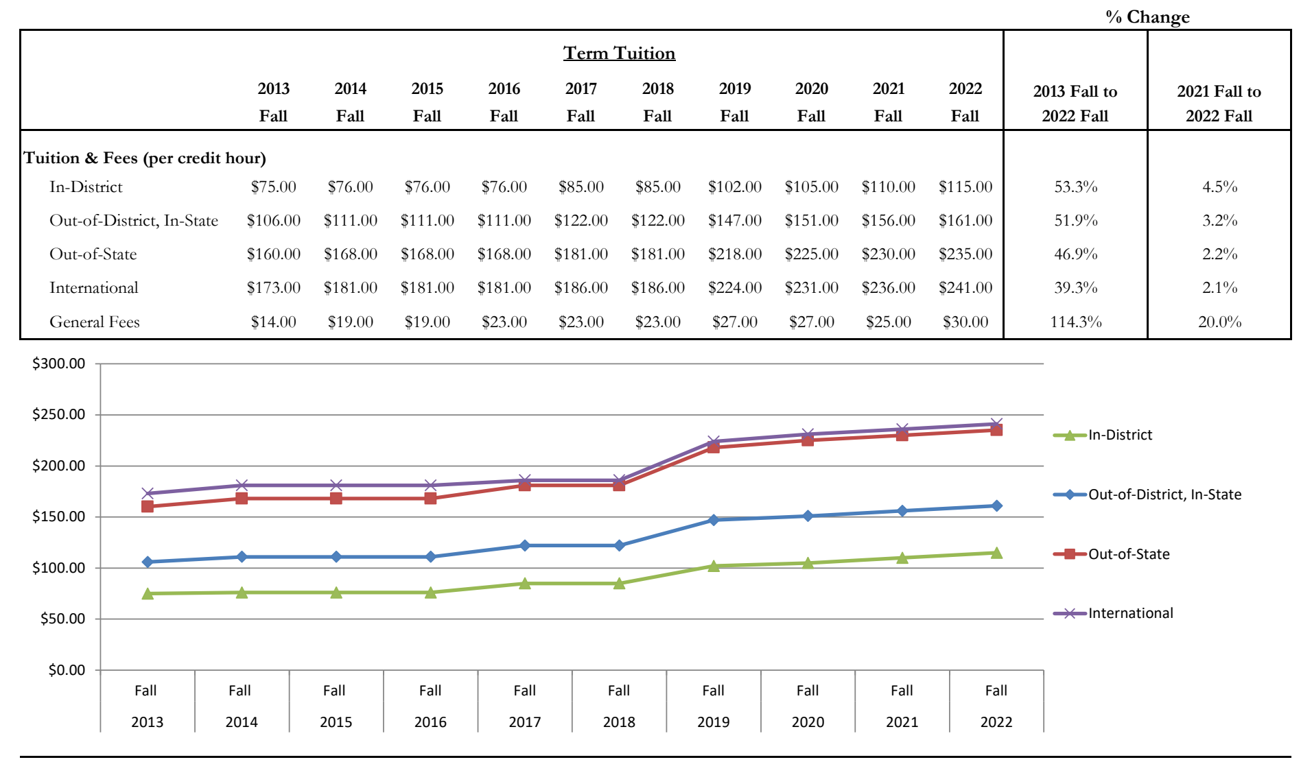
7.1 Tuition & Fees*