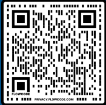
Prospective Student Form